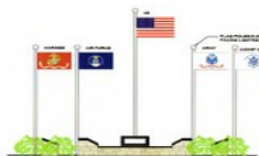
Sponsored by the Pellston DDA