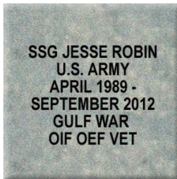
Example 8 x 8 Brick Paver