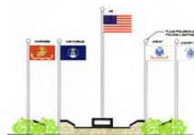
Sponsored by the Pellston DDA