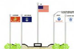
Sponsored by the Pellston DDA