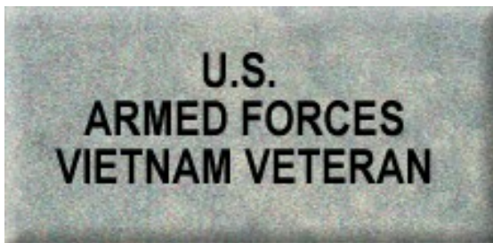
Example 4 x 8 Brick Paver