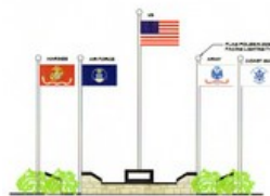
Sponsored by the Pellston DDA